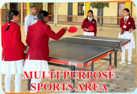
MULTI PURPOSE SPORTS AREA